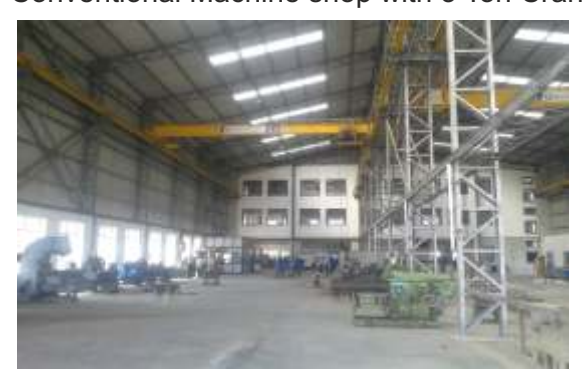
Conventional Machine shop